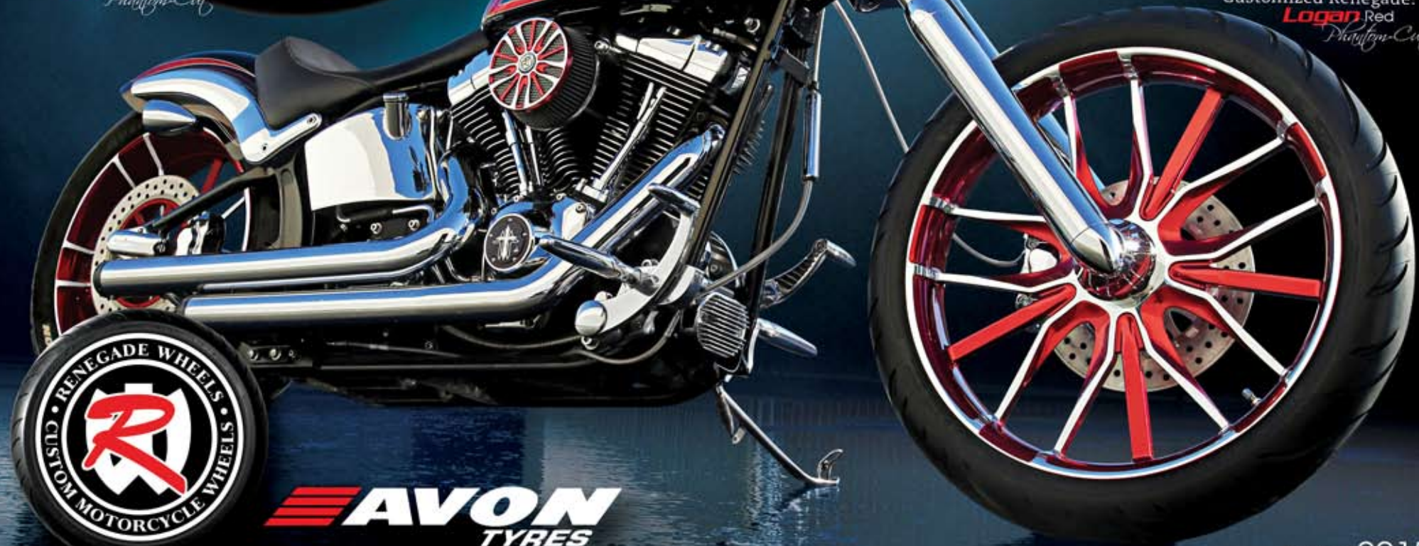
Customized Renegade! Logan Red Phantom-Cut