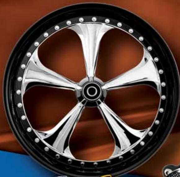
Tahoe Elite AIR CLEANER