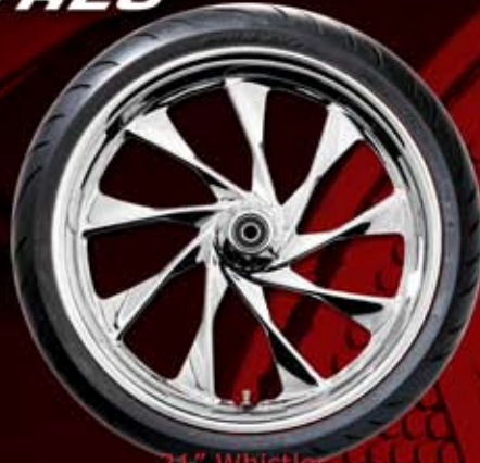
21" Whistler Avon Cobra AV71 120/70H21