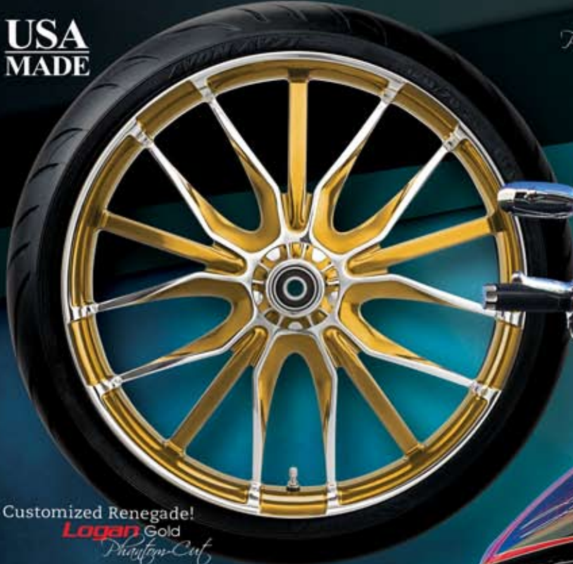
Customized Renegade! Logan Gold Phantom-Cut